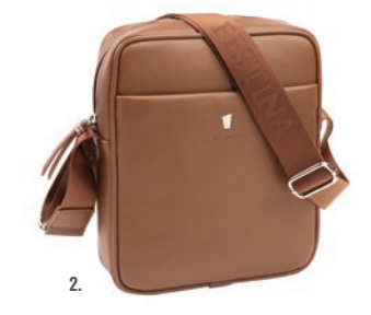
2. FTR223Z Classicals Camel Reporter bag