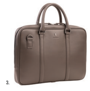
3. FTL223H Classicals Grey Laptop bag