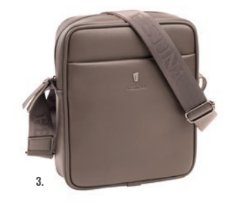
3. FTR223H Classicals Grey Reporter bag

Classicals Black Reporter bag The Classicals pen line is made of brass. Fountain pens are delivered with blue ink refills. Rollerball pens and ballpoint pens are outfitted with black ink refills as standard. Pens are delivered in a FESTINA gift box (FBS100).