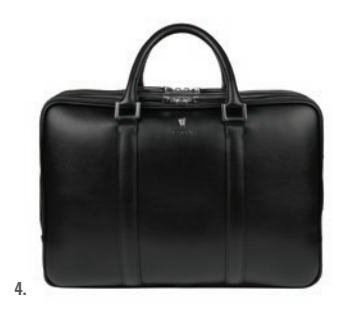
4. FTD223A Classicals Black Document bag