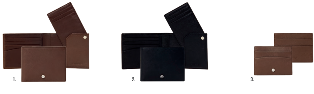
1. FLW326Y Button Brown Wallet