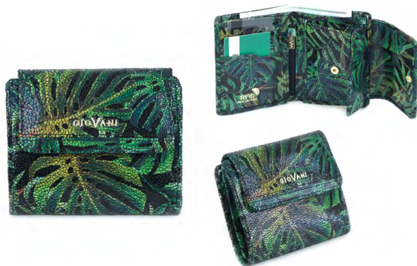
GV-04 /PAL width: 120 mm height: 95 mm

Wallet with 2 bill compartments, coin pocket, 2 pockets, 1 zippered pockets and places for 4 cards.