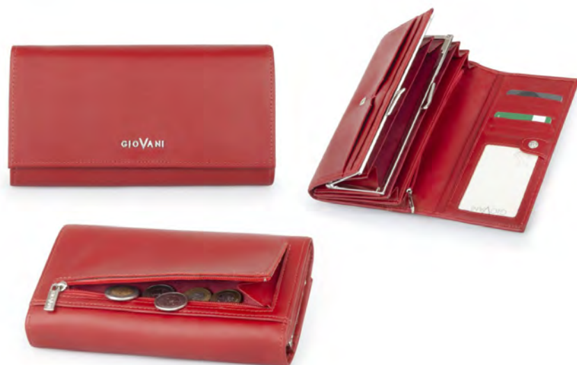
CE-300-D width: 185 mm height: 100 mm

Wallet Women's made of high quality calf leather, it has three compartments for banknotes, three pockets, two Zippered pockets, one inside the wallet and the second from the outside back, eleven card slots, one window ID and a pocket for coins fastened with snap.