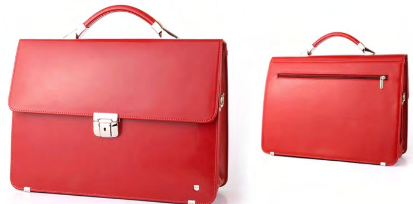
B-550/B width: 375 mm height: 280 mm

Women bag made of high quality Italian leather. It has three compartments, two zippered pockets and a holder for the phone and office supplies.