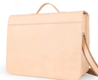
B-903/JU width: 380 mm height: 310 mm

Dual-chamber bag made of high quality Russia leather in its interior has a handle on the phone, pens and card slots. From the outside, there are two smaller pockets for small items.