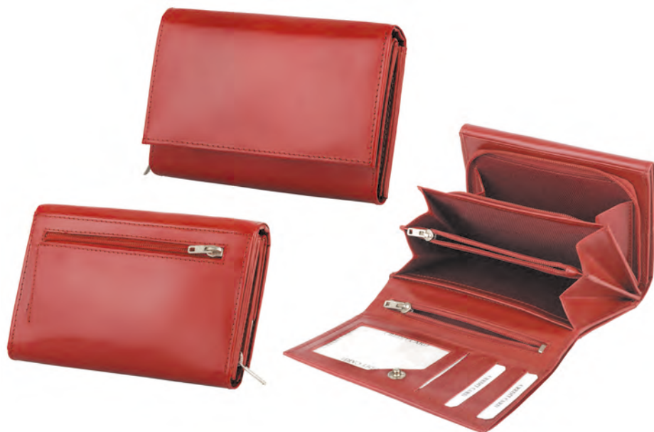
5453D/A RFID width: 100 mm height: 140 mm

A women's wallet with dimensions of 100mm by 140mm, has two pockets with snaps, two compartments for banknotes, four pockets with zippers and technologies that prevent the theft of data from payment cards.