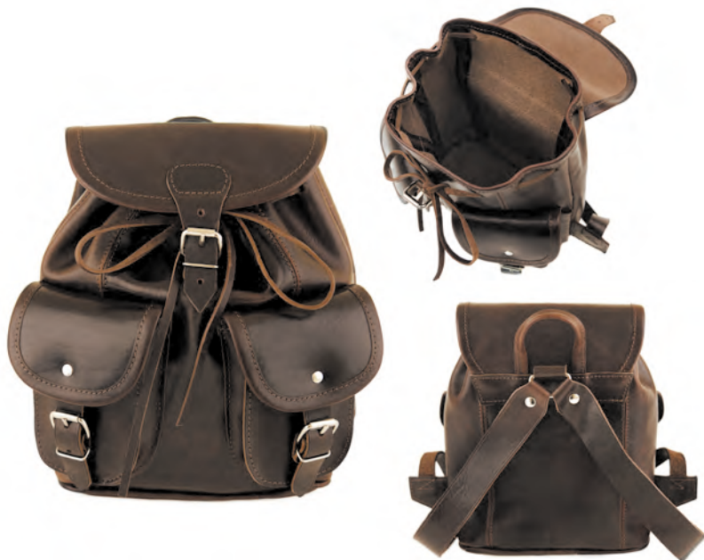
B-900/JU width: 250 mm height: 270 mm

The backpack is made of high quality Russian leather, it has one large main compartment and two smaller from the front of the backpack to the little things.