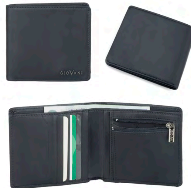
CE-105-M width: 115 mm height: 105 mm

Male wallet of medium size fastened strap with snap. Made of high-quality calf leather. It has two compartments for banknotes and one with zip, four pockets, six card slots, two ID windows and a pocket for coins fastened the latch.