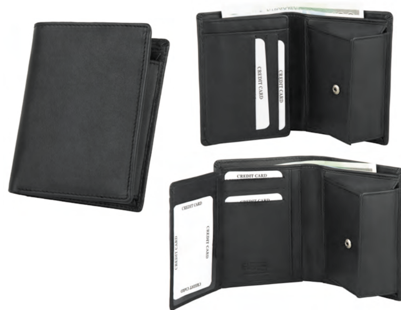
5455M/A RFID width: 95 mm height: 115 mm

Wallet with 2 bill compartments, coin pocket, 3 pockets, places for 6 cards and one ID window.