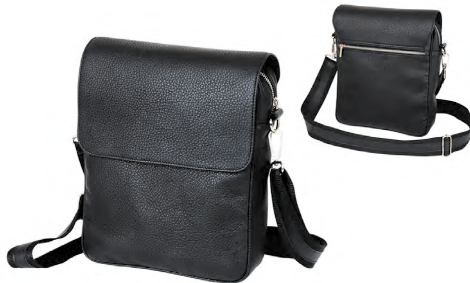
B-937/GR width: 235 mm height: 290 mm

The backpack is made of high quality Russian leather, it has one large main compartment and two smaller from the front of the backpack to the little things.