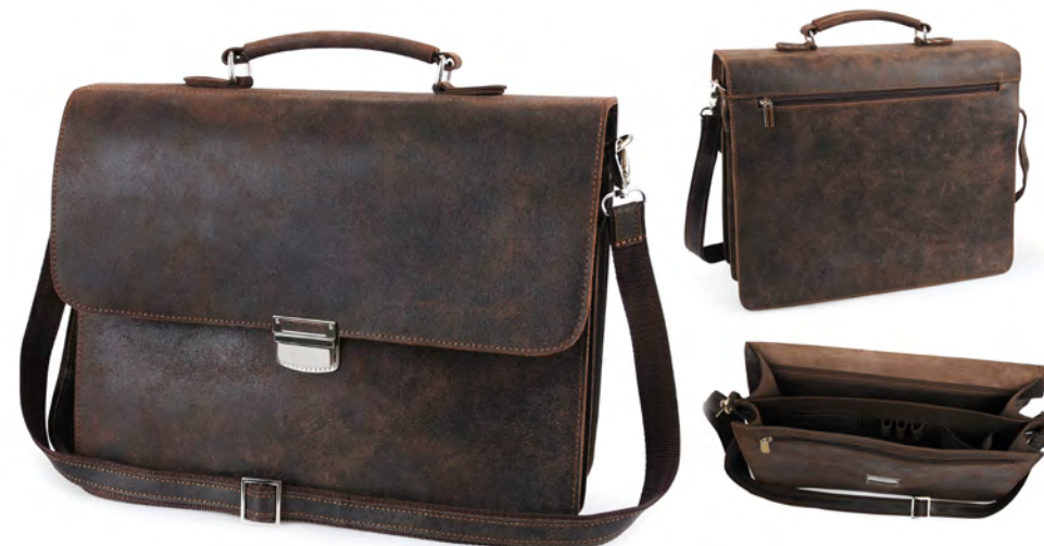
B-936/CRE width: 310 mm height: 355 mm

Small-sized bag satchel strap fastened with a buckle. Inside are two compartments, zip pocket, phone pocket and four places for pens. The bag has a detachable shoulder strap and removable braces.