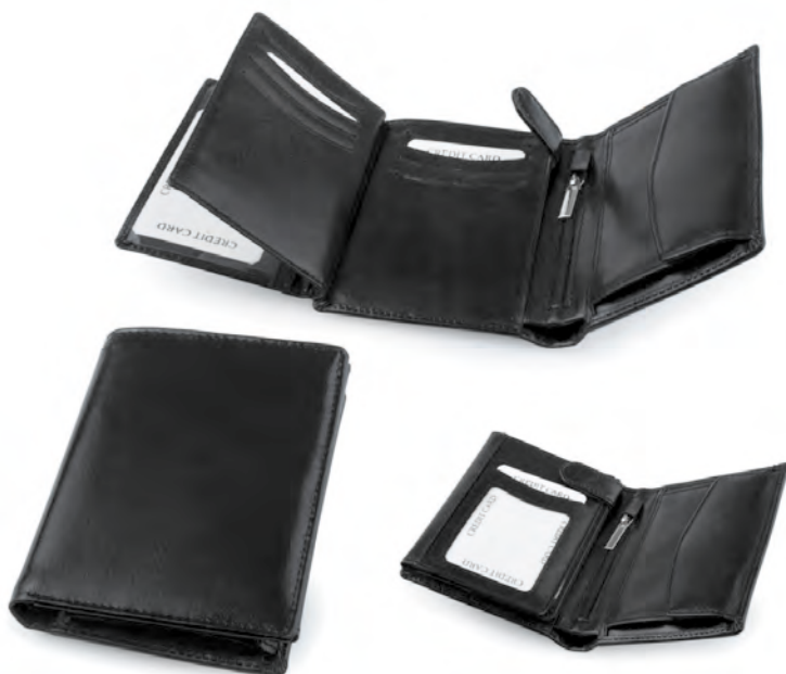
012M/A width: 95 mm height: 125 mm

Wallet with 2 bill compartments, coin pocket, 2 pockets, places for 6 cards and one ID window.