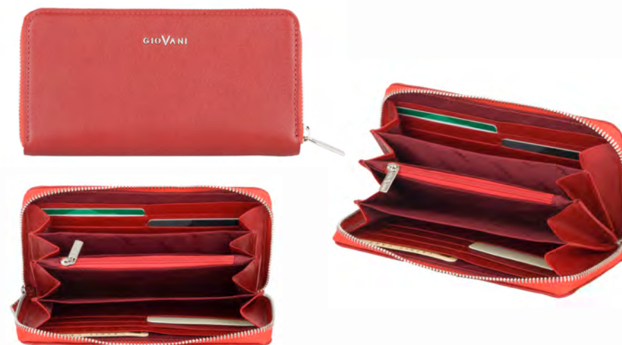
CE-172-D width: 185 mm height: 100 mm

Wallet Women's made of high quality calf leather, it has three compartments for banknotes, three pockets, two Zippered pockets, one inside the wallet and the second from the outside back, eleven card slots, one window ID and a pocket for coins fastened with snap.