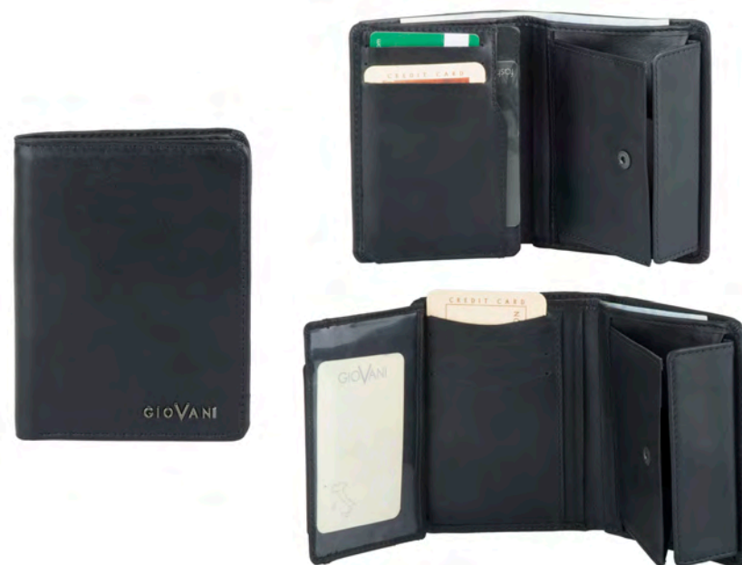
CE-302-M width: 95 mm height: 120 mm

Men's wallet made of high quality calf leather. It has two compartments for banknotes, one pocket, one more pocket zipped, nine card slots, three window ID, can accommodate a car registration documents and a pocket for coins fastened the latch.