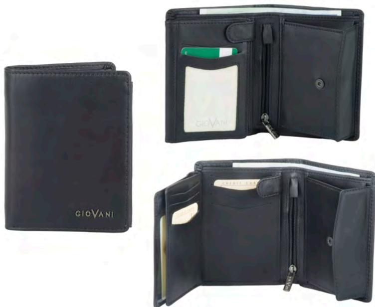
CE-012-M width: 95 mm height: 125 mm

Male wallet, made of high-quality calf leather. It has two compartments for notes, three pockets, seven card slots and the coin pocket is zippered.