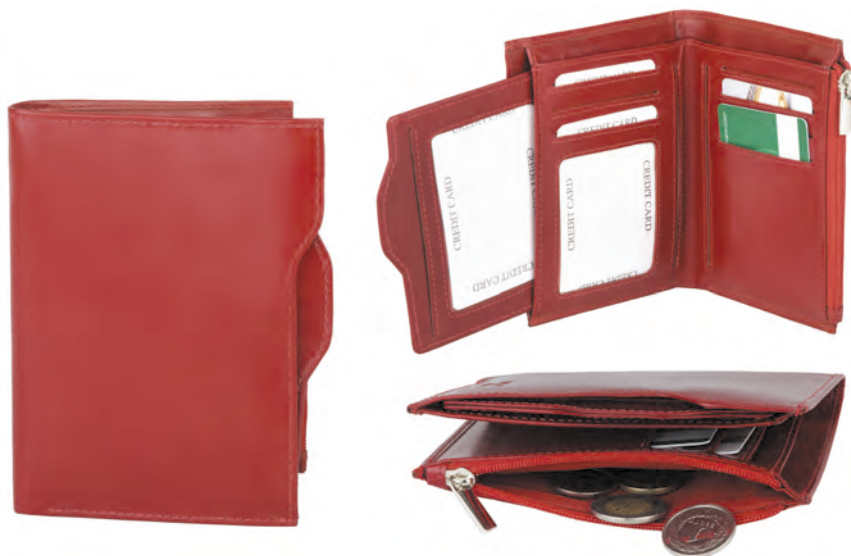
717D/A width: 100 mm height: 125 mm

Medium-sized wallet for women, made of natural Italian leather. Interior functional and well laid out. It has two compartments for banknotes, two pockets, one zipped pocket, seven card slots and one ID window, and the coin pocket is fastened to the latch.