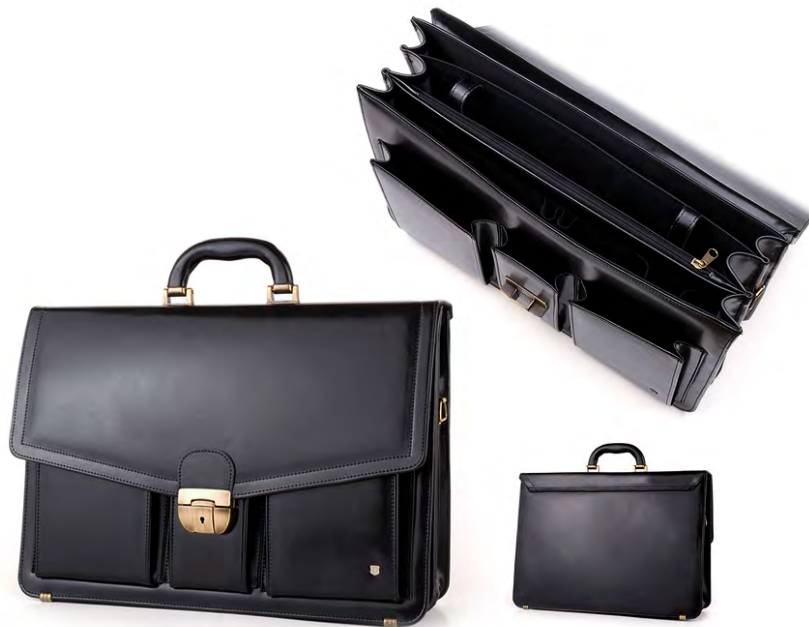
B-621/B width: 415 mm height: 305 mm

Briefcase made from natural Italian leather. Inside there are three divided sections included one big zipper pocket, three small pockets, two places for cards, two pen holders and space for a mobile phone. From the bottom of the briefcase has metal feet to protect against damage. Additionally there is removable shoulder strap.