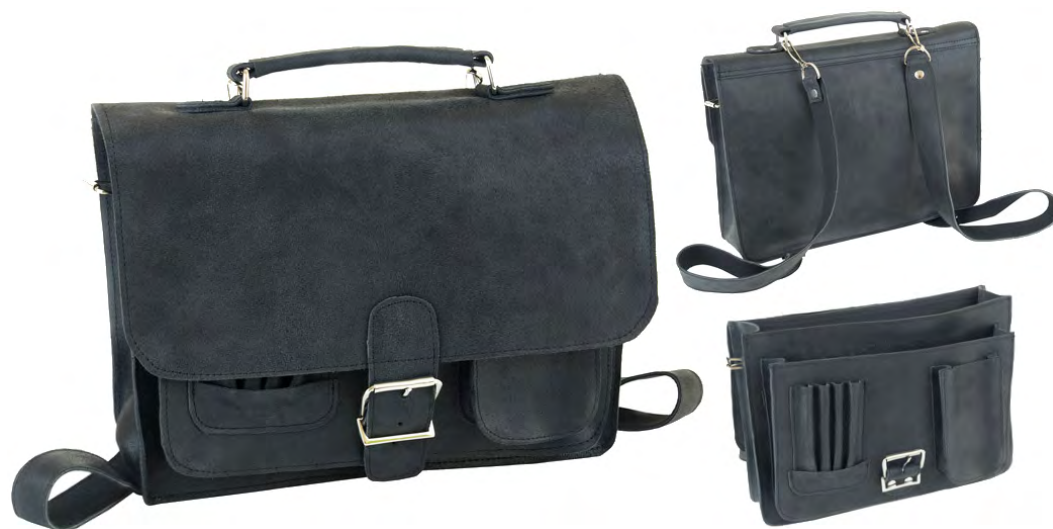
B-890/CRE width: 325 mm height: 245 mm

Simple and functional leather case with 6 places for cards and a pocket.