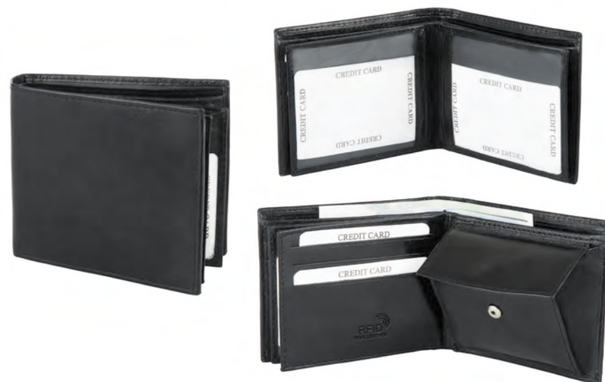
288M/A RFID width: 105 mm height: 90 mm

Simple and functional leather case with 6 places for cards and a pocket.