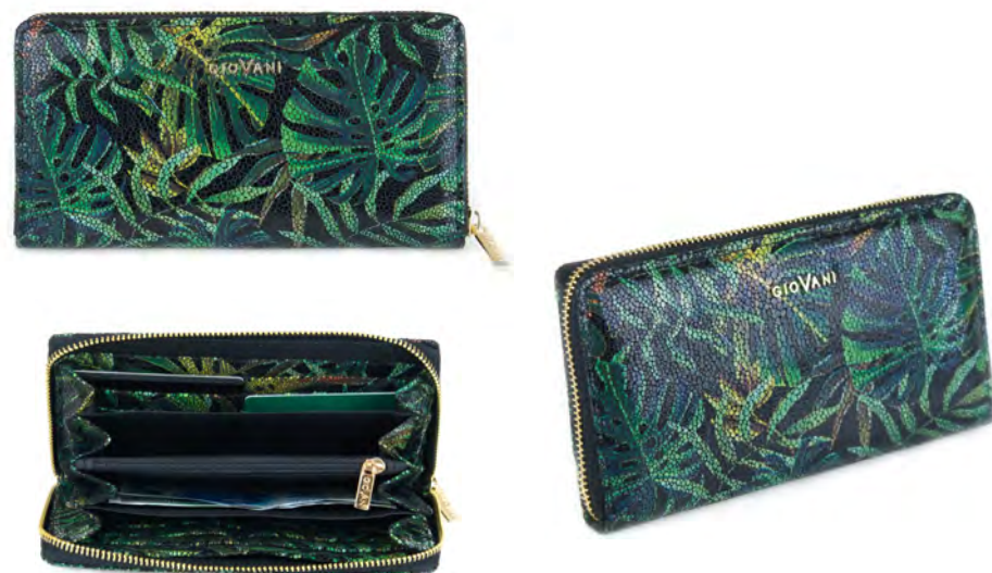
172D /PAL width: 185 mm height: 100 mm

Wallet with 2 bill compartments, coin pocket, 2 pockets, 1 zippered pockets and places for 4 cards.