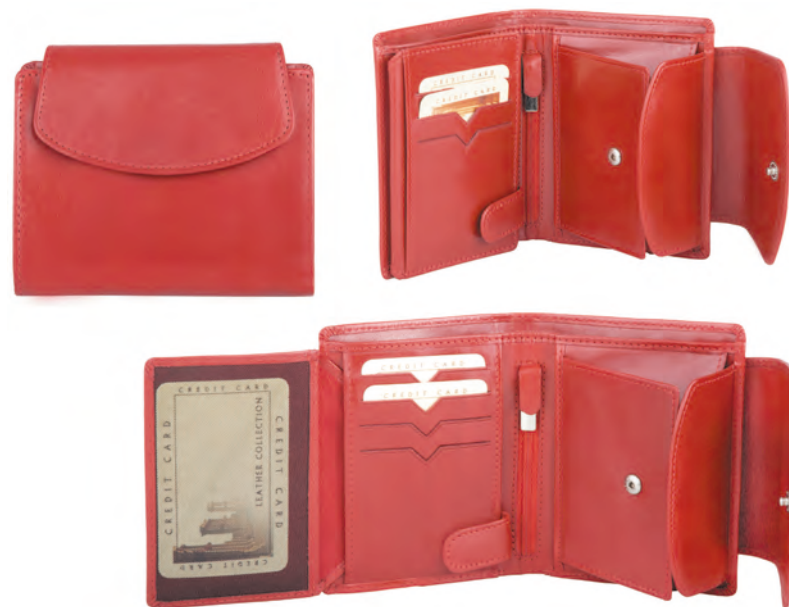
009D/A RFID width: 90 mm height: 115 mm

A women's wallet with dimensions of 100mm by 140mm, has two pockets with snaps, two compartments for banknotes, four pockets with zippers and technologies that prevent the theft of data from payment cards.