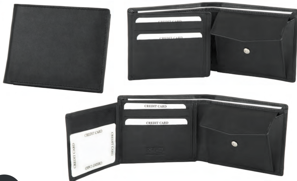
5454M/A RFID width: 115 mm height: 95 mm

Wallet with 2 bill compartments, coin pocket, 3 pockets, places for 6 cards and one ID window.