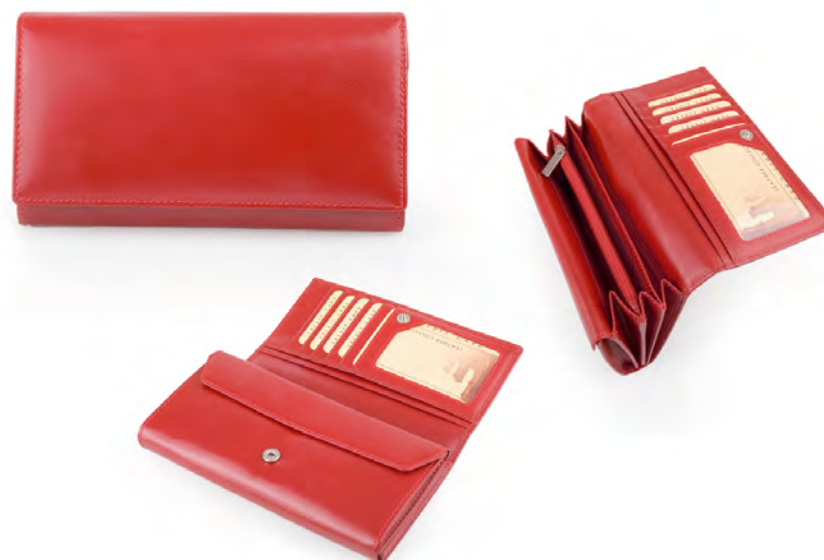
008D/A width: 165 mm height: 90 mm

Simple and functional leather case with 6 places for cards and a pocket.