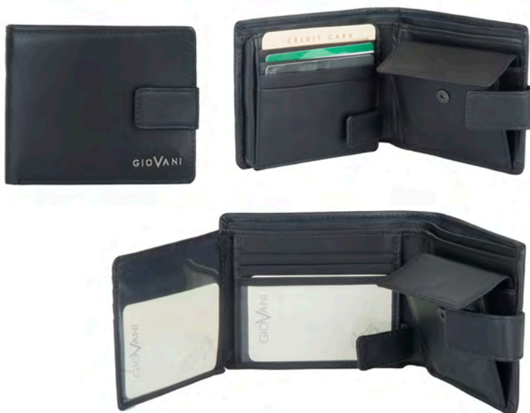
CE-005-M width: 115 mm height: 95 mm

Male wallet of medium size fastened strap with snap. Made of high-quality calf leather. It has two compartments for banknotes and one with zip, four pockets, six card slots, two ID windows and a pocket for coins fastened the latch.