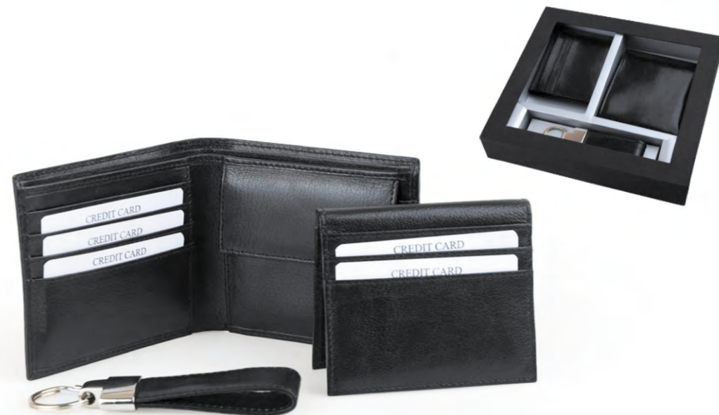
SE-200/A width: 220 mm height: 205 mm

Set-contains three things: one men's wallet with two compartments on money, one coin pocket, and 4 places on cards, and 1 add pocket. One business card holder with 1 big compartments, inside are 2 places on cards, and pocket outside, and one key holder.