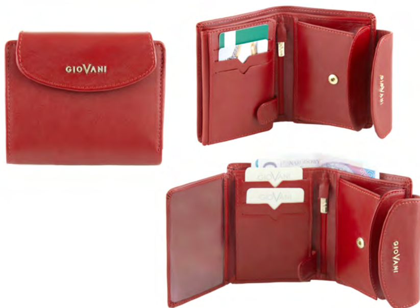
CE-009-D width: 90 mm height: 115 mm

Women's wallet made of high quality calf leather, zippered. It has four compartments for notes, two pockets, twelve card slots and the coin compartment is zippered.