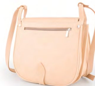
B-886/JU width: 290 mm height: 255 mm

Leather handbag jute fastened with a magnetic clip. Inside there are three compartments, one of which is zippered pocket and also zip. On the back of the bag is a large zippered pocket.