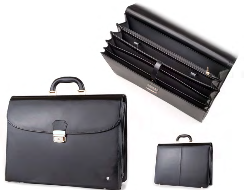
B-809/B width: 425 mm height: 315 mm

Briefcase made from natural Italian leather. Inside there are three divided sections included one big zipper pocket, three small pockets, two places for cards, two pen holders and space for a mobile phone. From the bottom of the briefcase has metal feet to protect against damage. Additionally there is removable shoulder strap.