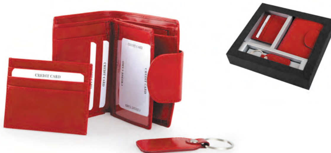
SE-300/A width: 220 mm height: 205 mm

Set-contains three things: one men's wallet with two compartments for banknotes, one coin pocket and 6 places for cards, 6 pockets and 1 ID window. One business card holder with 6 places for cards, 1 window, and one key holder.