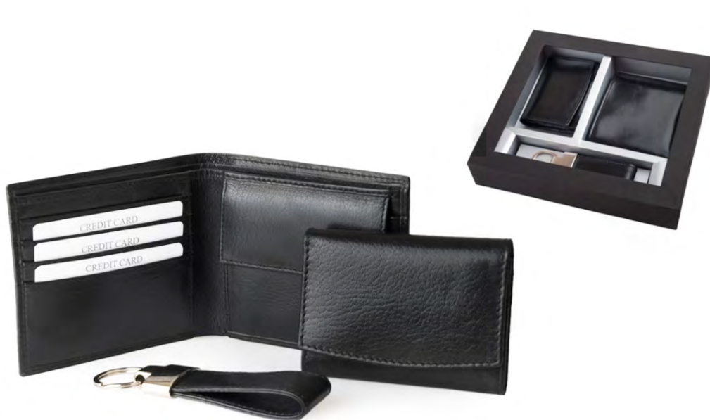
SE-100/A width: 220 mm height: 205 mm

Set-contains three things: one men's wallet with two compartments on money, one coin pocket, and 4 places on cards, and 1 add pocket. One business card holder with 1 big compartments, inside are 2 places on cards, and pocket outside, and one key holder.