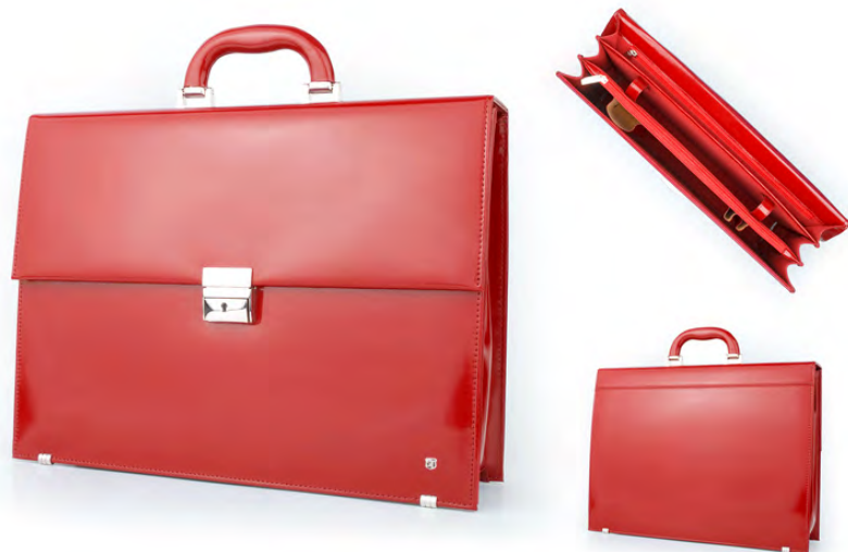
B-865/B width: 395 mm height: 300 mm

Briefcase made from natural Italian leather. Inside there are five compartments includes one zipper compartment, one pocket closed with magnetic clip, three pen holders and space for a mobile phone. From the bottom of the briefcase has metal feet to protect against damage.