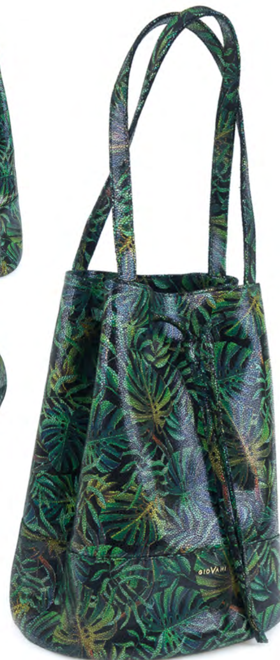
B-908 /PAL width: 350 mm height: 270 mm

Bag type handbag. It has one large compartment, 2 pockets and 1 zippered pocket.