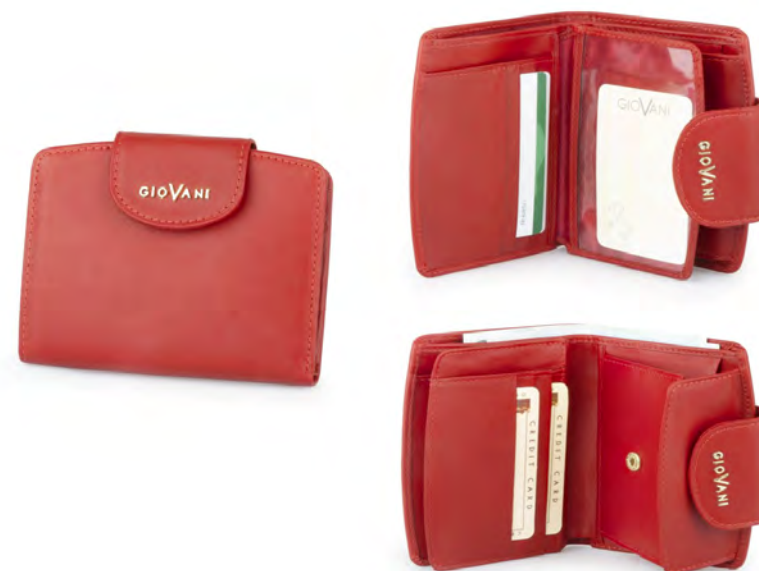
CE-003-D width: 100 mm height: 125 mm

Medium-sized wallet for women, made of natural Italian leather. Interior functional and well laid out. It has two compartments for banknotes, two pockets, one zipped pocket, seven card slots and one ID window, and the coin pocket is fastened to the latch.